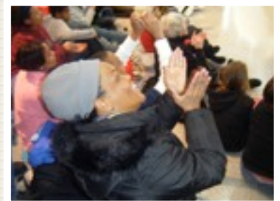
WARM INSIDE THE NEWSEUM CHEERING OUR NEW PRESIDENT