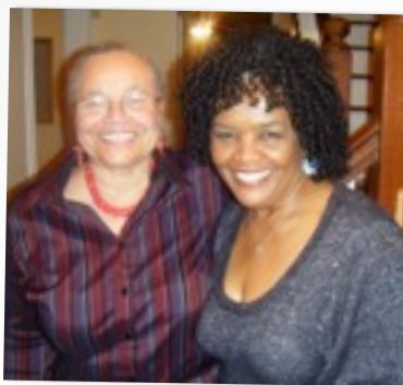
WITH DAPHNE MUSE AT HER PRE-INAUGURAL PARTY