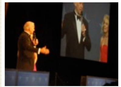
THE BIDENS THANK THE CROWD AT THE BALL