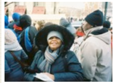
FREEZING AS I WAIT FOR THE CEREMONY TO BEGIN