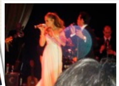
J-LO IS A SURPRISE GUEST WITH HUBBY MARC ANTHONY